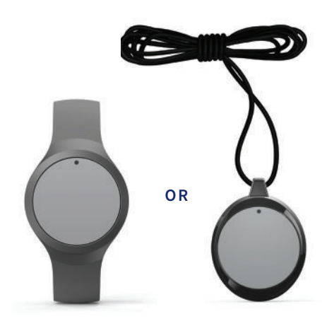
ACCESSORY WRIST BUTTON